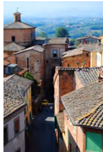
Above, left: Drawing As Seeing, drawing in the Duomo. Right: Street view, Siena, Italy

To register for the class, or for more information, contact: