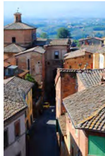
Above, left: Drawing As Seeing, drawing in the Duomo. Right: Street view, Siena, Italy

To register for the class, or for more information, contact: