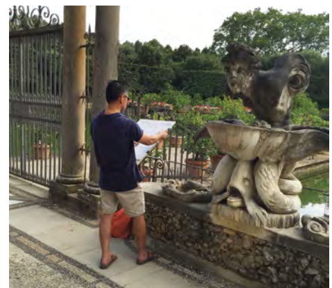
Right, Drawing in the Boboli Gardens, Florence, Italy